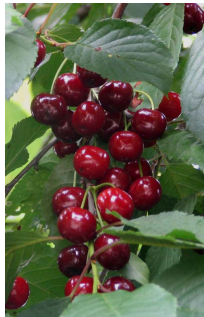
Figure 1. Fruits of 'Feketička' (F-1 genotype)

Pomological properties. The highest fruit weight was observed in F-1 genotype (Fig. 1) and the lowest in F-4 (8.1 g and 3.9 g, respectively) (Tab. 2). According to the classification of ALBERTINI and DELLA STRADA (2001), fruits of seven genotypes studied (F-1, F-2, F-3, F-5, F-6, F-7 and F-8) were classified as large, whereas those of F-9 and F-4 genotypes were classified as medium-large and small, respectively. In all the genotypes, fruits were oblate in shape and had relatively uniform shape factor. Stalk length was mid-long, except in F-1 and F-8 genotypes where stalk was long. F-8 genotype had the largest stone (0.55 g) which was the smallest in F-4 (0.36 g).