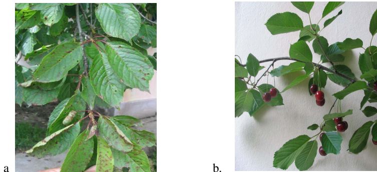
Figure 2. Health condition of leaves of 'Feketička' at the end of June: a. F-3 genotype; b. F-6 genotype